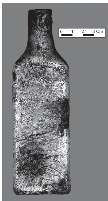
Figure 6: Glass bottle recovered from the Ogilby site.