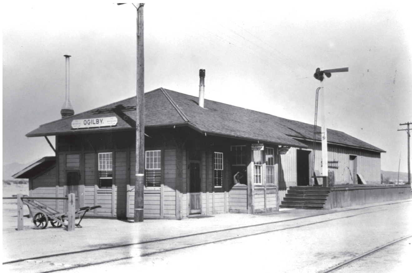
Figure 3: The railroad depot at Ogilby ca. 1913.