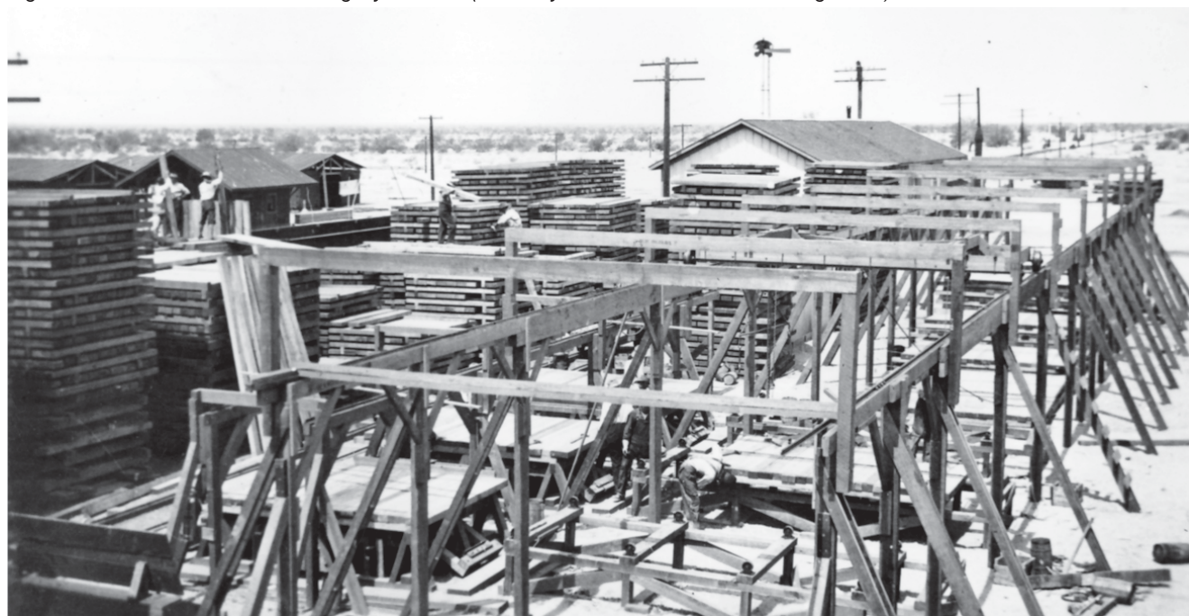
Figure 4: Plank Road fabrication at Ogilby ca. 1916 (Courtesy of the Bureau of Land Management).